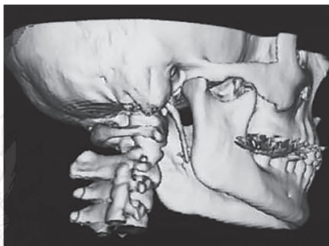
Fig. 3: 3D CT shows enlarged styloid process without compressing any vascular structure