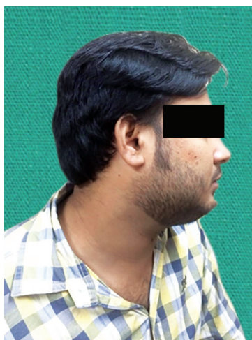
Fig. 1: Young male with severe right sided anterior neck pain

Hence, a diagnosis of stylalgia was made and a 3D CT scan of neck was advised to rule out any possibility of developing an Eagle's syndrome. Eventually 3D CT shows enlarged styloid process without compressing any vascular structure (Fig. 3). Patient was improved with NSAIDS, physical modalities and exercises.