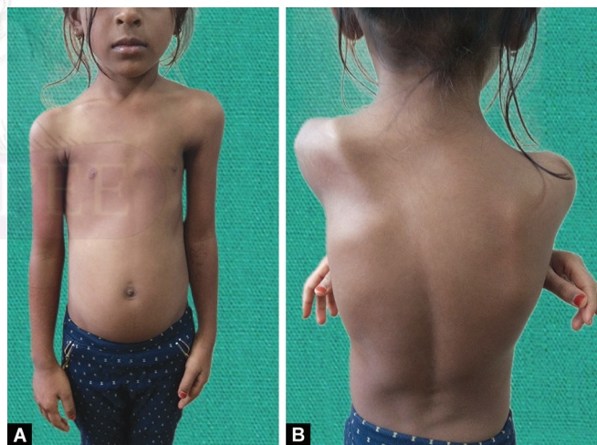
FIGS 1A and B: (A) Left-side shoulder at higher level than right; (B) Left hypoplastic scapula